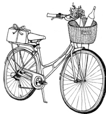
ILLUSTRATION JASPER S